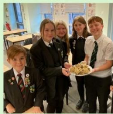
Some of our Geography Club eco champions.